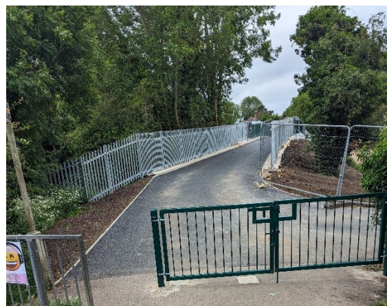
New gates from Warwick Park lead to new pedestrian bridge beyond.