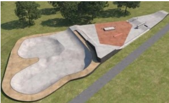
Skatepark on Warwick Park

On behalf of the Kibworth Joint Recreation Board I continued to help the clerks apply for section 106 funding in 2023/24 for a double zipwire and skatepark in Warwick Park. As of May 2023, funding was approved for a trim trail in Smeeton Road Park and a zipwire and skatepark in Warwick Park.