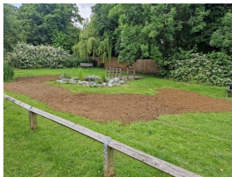
New concrete and fibre glass lined pond, now fitted, filled and planted – ready for new wildflowers

The pond in Rookery Park has continued to be improved with additional levels of hardcore and soil to raise the surrounding ground; this was provided at no cost to the parish by a subsidiary of Network Rail, who had been electrifying the Midland Mainline through the two Kibworth parishes during 2023/24.