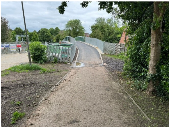
The new pedestrian bridge from School Road

Network Rail have been installing cables to enable electrification of the railway between Kettering and Wigston during 2023/24. In addition to railway bridges between Great Glen and Wistow which have had to be replaced and have taken some 6 months to complete, the B1 right of way bridge leading from Warwick Park to School Road in Kibworth Beauchamp has also taken over 6 months to complete and involved a temporary pedestrian bridge being installed after meetings with councillors including myself on numerous occasions, the MP and Network Rail. Some negotiating with the contractors by the parish manager meant several construction jobs in the parishes were provided by their staff – e.g. installing benches on concrete slabs, trimming hedges etc.